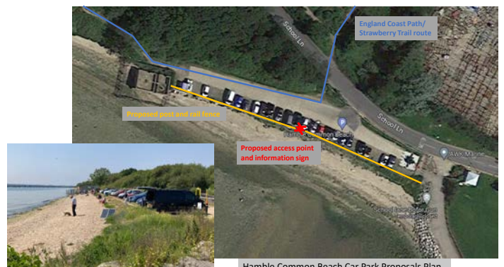
Hamble Common Beach Car Park Proposals Plan

This is an Eastleigh Borough Council project, carried out on EBC-owned land. We are sharing this information to give you advance notice of the changes. If you have any questions about the works, please contact Eastleigh Borough Council directly.