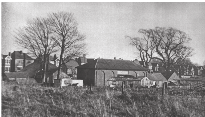
Sydney Farm, now present-day Grantham Avenue.