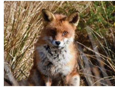
Kestrel in flight, Kestrel, Linnet and Fox.