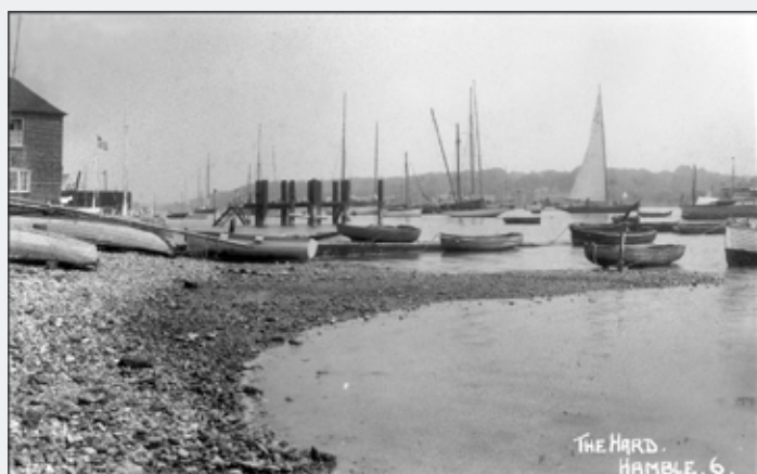
Hamble Public Hard and Foreshore.

The Society has been fortunate to receive some old glass slides of pictures of Hamble prior to the Second World War. Below are just a few examples that give an insight what Hamble looked like in the late 1930s.