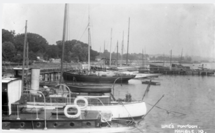
Lukes Boatyard pontoons and mud berths.