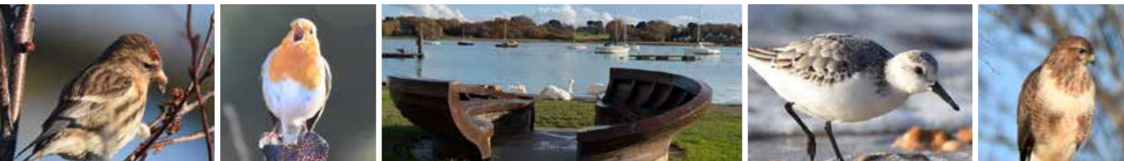
Redpoll, Robin, Swans at The Foreshore, Sanderling and Common Buzzard.

Share your pet or Hamble photos for us to include in future newsletters! Send them to us via Facebook, or email them to danielle@smartmarketinguk.com