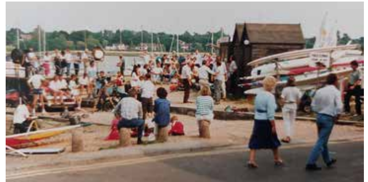
Filming Howard's Way at Hamble.