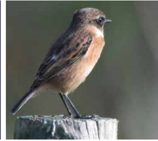
Wheatear at Hamble Point and Stonechat at Hamble Common.