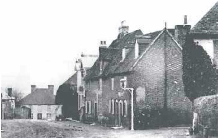
Purbrook Cottages early 1900s