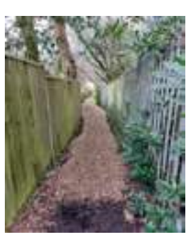
After the works