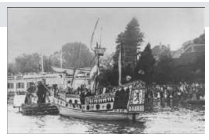
Hamble Regatta, 1932.

In the 1960s the regatta became the Hamble Regatta and Carnival that included blindfold rowing races and boat tug of wars, plus school children sports, a donkey derby, barbeques, and floodlight sailing ballets. Very