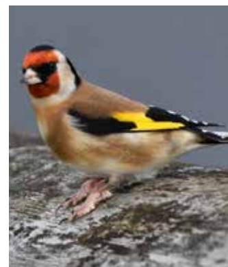
Black Redstart and Goldfinch and pet photo - frog... or dog?

Share your pet or Hamble photos for us to include in future newsletters! Send them to us via Facebook, or email them to danielle@smartmarketinguk.com