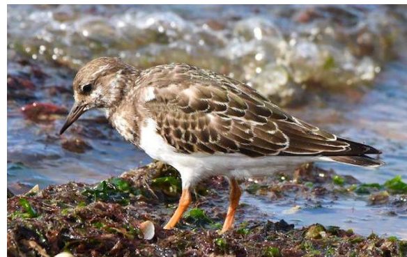
Birds in Hamble: Jay, Wheatear and Turnstone.