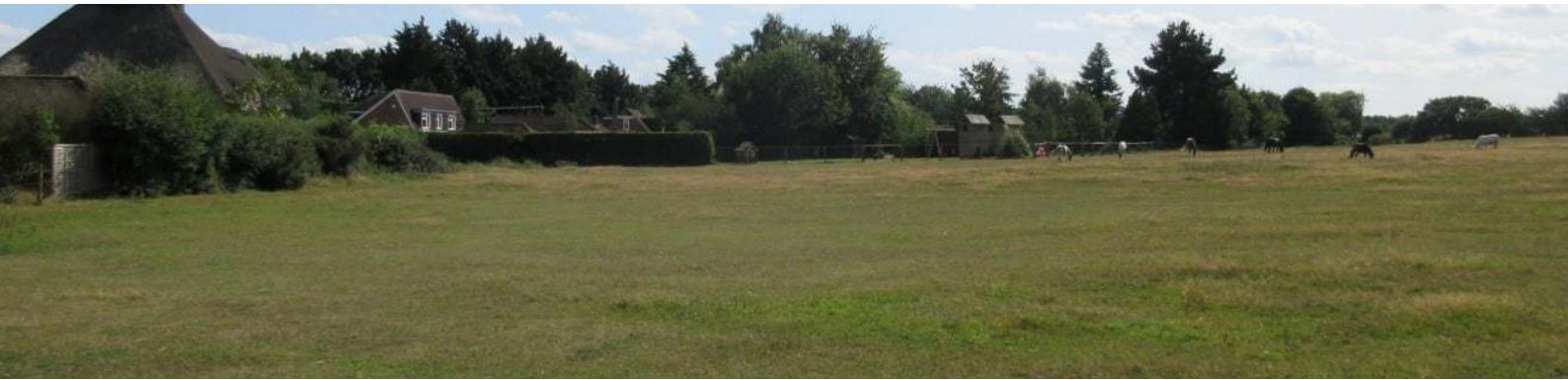
Hamble Airfield (From HPC Facebook Page)