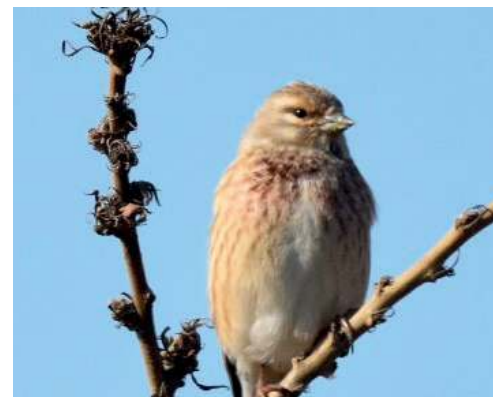
Westfield Common