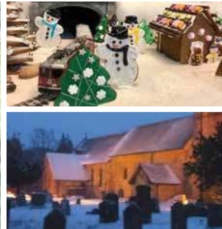
Photos taken during Winter months in Hamble