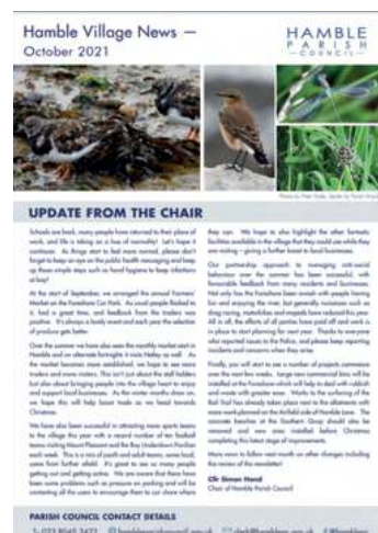
Village Magazine (left) and new look Newsletter (right)