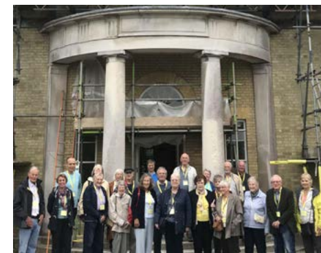
History Society members outside of Sydney Lodge