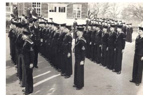
Earl Mountbatten inspecting the ships company, March 1955

Apart from when we went rowing, sailing or cross-country running we were mostly confined to the 45 acres of the Mercury grounds. One of the few outings for the whole ship's company was the annual visit to the Whale Island Tournament at HMS Excellent, the Navy's shore-based gunnery school in Portsmouth. On Remembrance Sunday our buglers were invited to sound the Last Post at various Hampshire village war memorials. The rest of the ship's company marched down Satchell Lane behind our band and guard with their fixed bayonets and white belts and gaiters, to the village war memorial in Hamble Churchyard. The local folk came out of their homes to