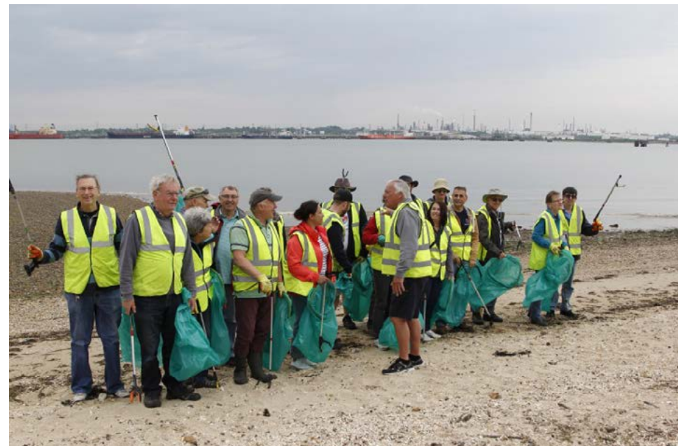
Getting ready for a recent beach clean.

Most people take their holidays in July and August and with reduced numbers of volunteers we take a break from the main tasks. However, it is also a time when litter-louts are very active so we continue with the beach cleans. The beach clean on 18th July is a special one that includes a thank you BBQ for all our volunteers. Please do not be put off if you have not been on a beach clean before, we would still be delighted to see you!