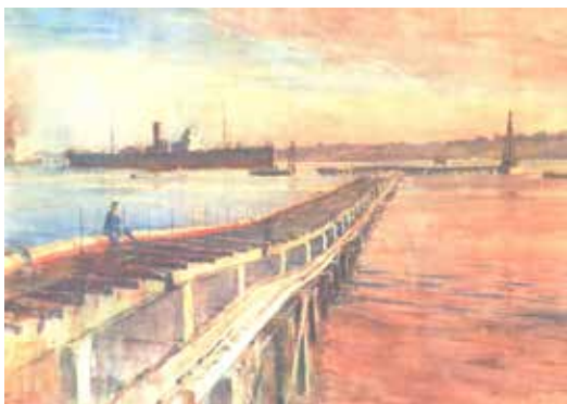
Painting by Gregory Robinson of the construction of the jetty with the hump in it. BP's storage ship 'British Maple' in the background.

BP's association with Hamble started on the 6th June 1922, when one of its ships the 'British Maple' was moored off Hamble to store oil products which were transported by lighters to Southampton Docks for distribution mostly by road tankers.