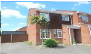
Netley Abbey £295,000