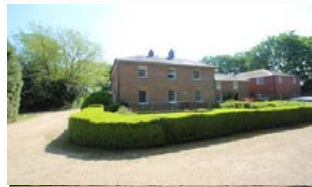
Netley Abbey £174,950