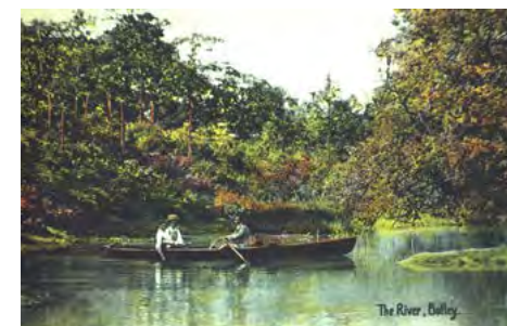
The river, Botley