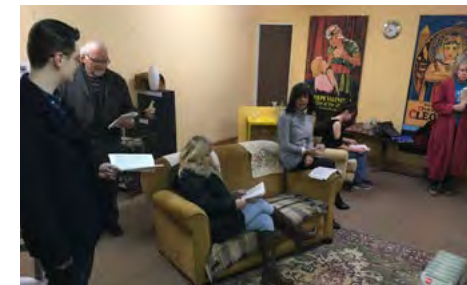
Hamble Players in rehearsal

As night falls and fog descends on Monument House Hotel and Alternative Health Spa, Hecuba Tomb and her niece Drusilla receive a series of unexpected visitors. Novelist Philippa and her assistant Daphne are seeking refuge from a mysterious follower they fear may be the notorious "Norfolk Strangler." Hot on their heels come TV historian Quentin Danesworth and vacuous honey-mooners Robert and Miranda. The uninvited guests are soon snooping around the secret passages of the creepy old mansion and asking too many questions for comfort. Sure enough, one by one they fall victim to violent deaths by devious techniques — no secret panel is unoccupied, no cup of tea untouched, and nobody is who they appear