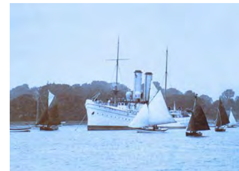
The river between the villages of Warsash and Hamble in 1910